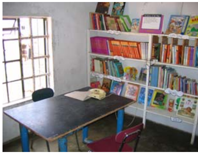
Tame Primary School's Bookroom ...

Students who never played sports because they only had their school uniform to wear, now are able to play and compete. Mangubeni Secondary placed second this year in soccer competition. In years previous, they never won a game.