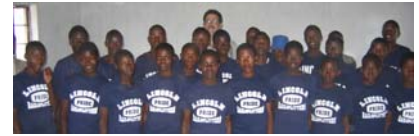
... A new Sports Team...